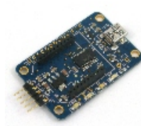
USB to RS232 TTL