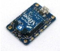
USB to Zigbee