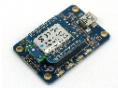
USB to Bluetooth